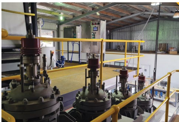
Figure 6 – Leach circuit – trials to begin shortly