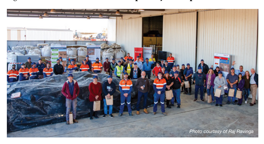
Figure 1 – Broken Hill Shareholder Open Day – Group Photo.

The COB processing technology exhibited at the Pilot Plant was explained to those in attendance as they toured throughout the facility. Interpretive signage helped to facilitate a deeper understanding of this new processing being deployed to extract cobalt and produce a battery-ready product.