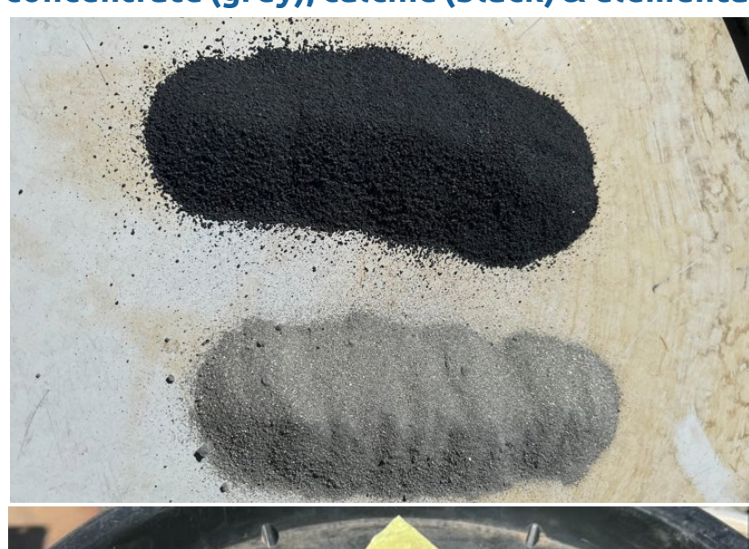
Dried concentrate (grey), calcine (black) & elemental sulphur